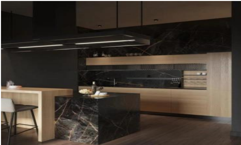
VILLAS 3, 4, 5, 6, 8, 9, 13