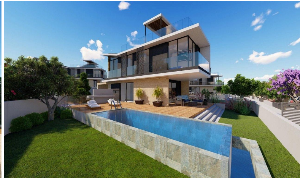
3 BEDROOM VILLA