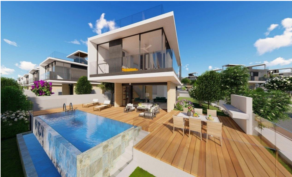
3 BEDROOM VILLA