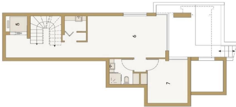
Lower ground floor