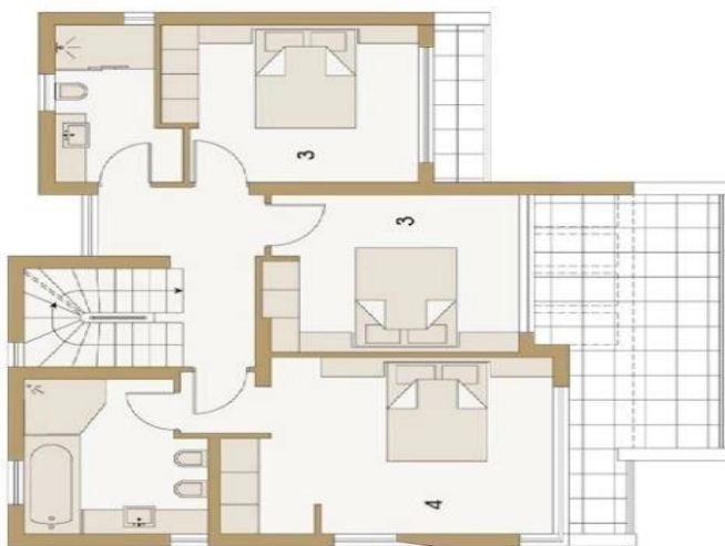
First floor - A4