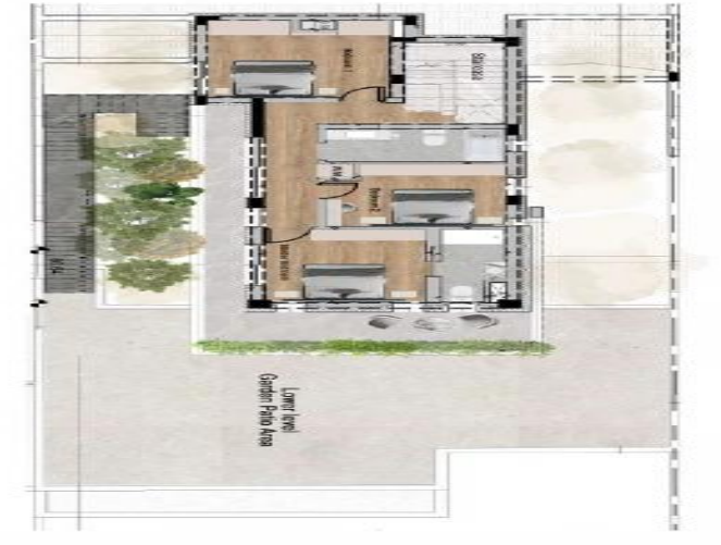
LOWER GROND FLOOR