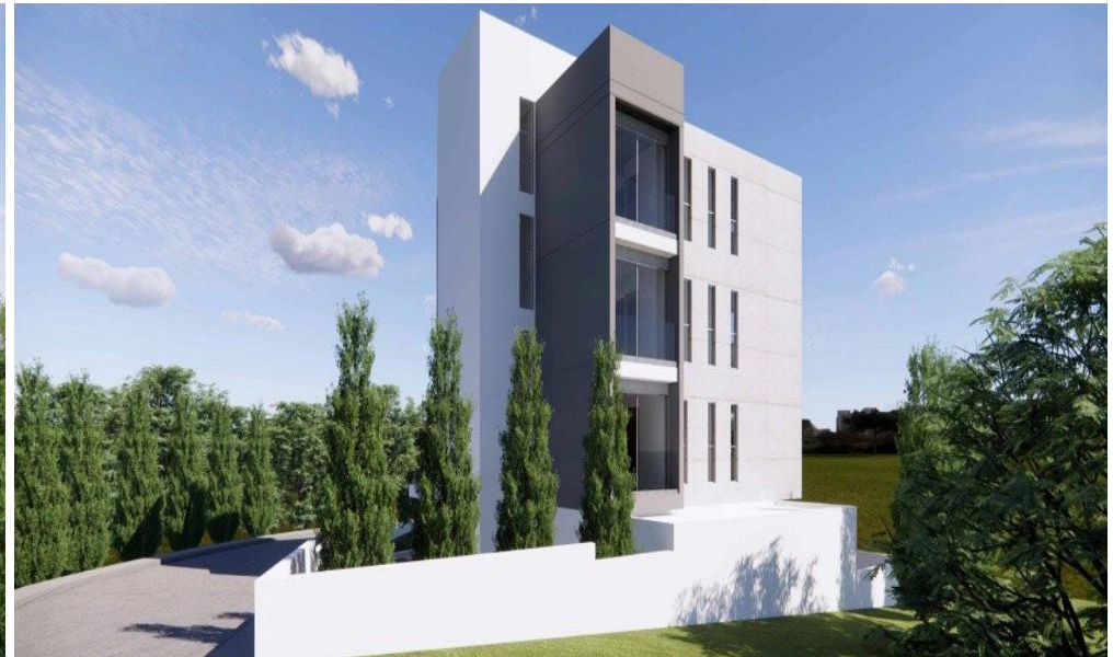
AMARANTHOS COURT / SECOND FLOOR / APARTMENT No. 201