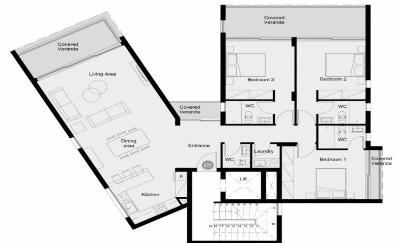
3 BEDROOM APARTMENT

Disclaimer / Please note that drawings and illustrations are for marketing purposes and should be used only as a guide. All efforts have been made to ensure their accuracy at the date of print.