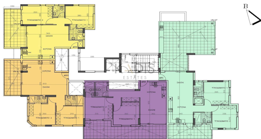
KATOHI 20T OPO*OT scale 1:100