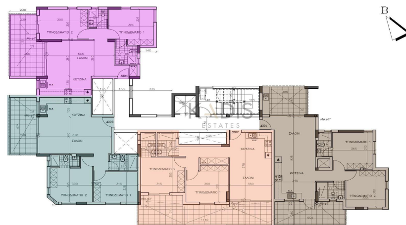
KATOHI 30T OPO*OT scale 1:100