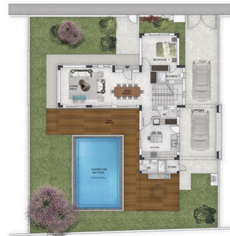
TYPE G GROUND FLOOR PLAN

VILLA TYPE G FOUR BEDROOM | VILLA 36, 37, 38 AND 41