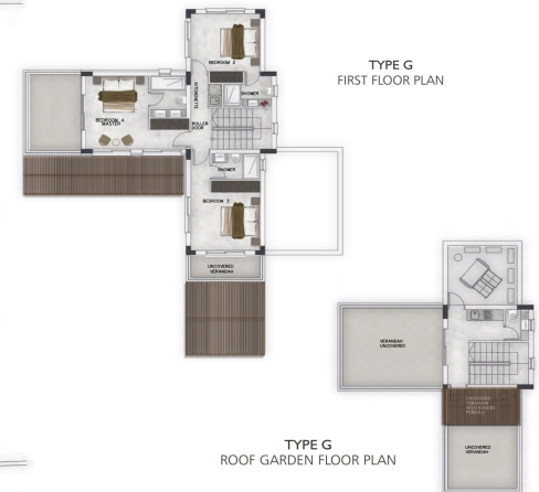
TYPE G FIRST FLOOR PLAN