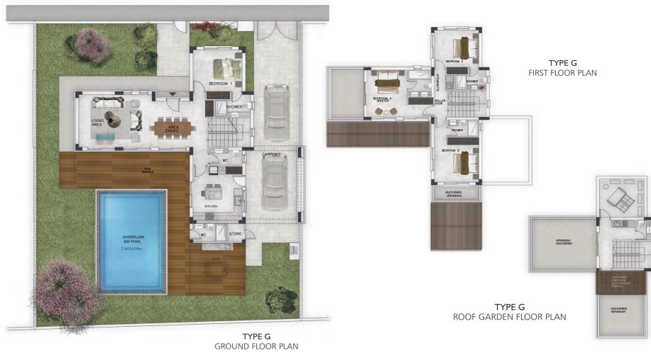
VILLA TYPE G FOUR BEDROOM | VILLA 36, 37, 38 AND 41