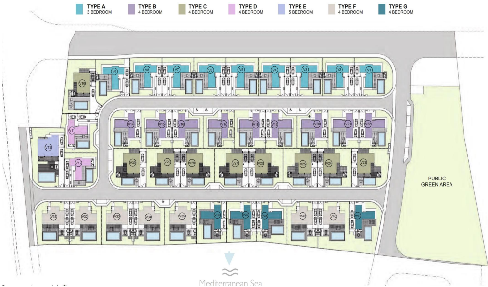
VILLA TYPE G FOUR BEDROOM | VILLA 36, 37, 38 AND 41