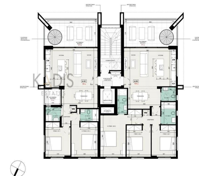
ΚΑΤΟΨΗ ΑΠΟΛΗΞΗΣ ΚΛΙΜΑΚΟΣΤΑΣΙΟΥ