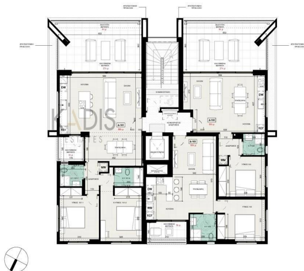
ΚΑΤΟΨΗ Β' ΟΡΟΦΟΥ