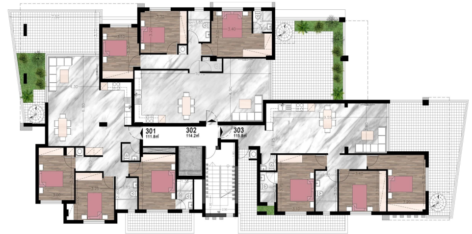
3rd FLOOR PLAN