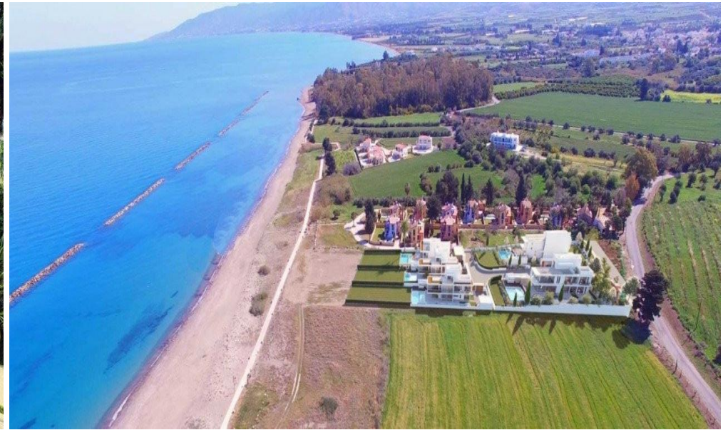
4 BEDROOM VILLA