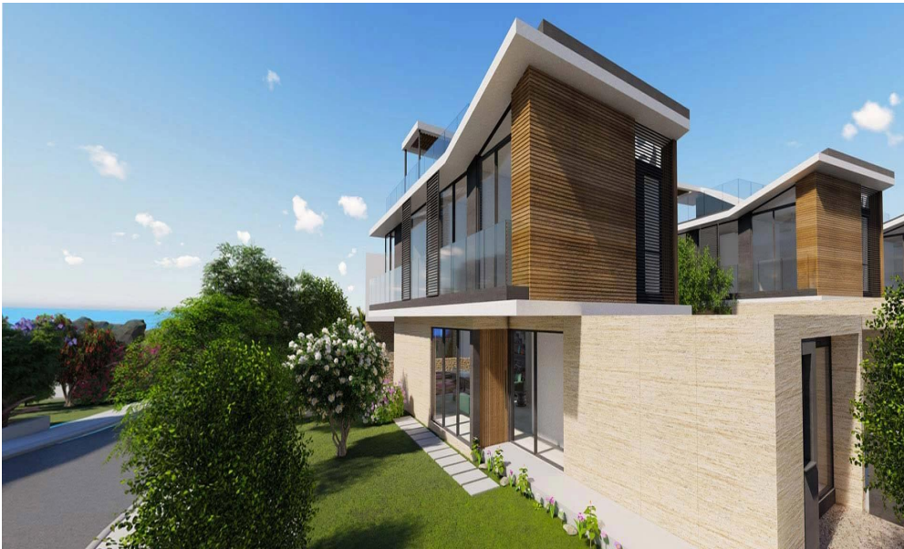
3 BEDROOM VILLA