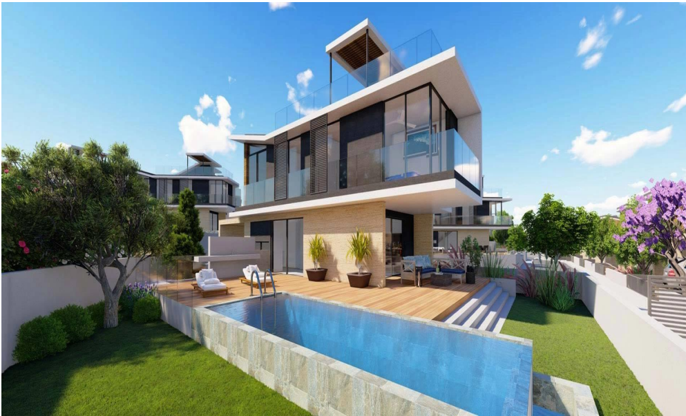
3 BEDROOM VILLA