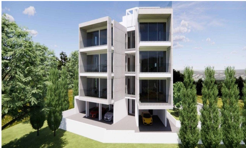
AMARANTHOS COURT / FIRST FLOOR / APARTMENT No. 101