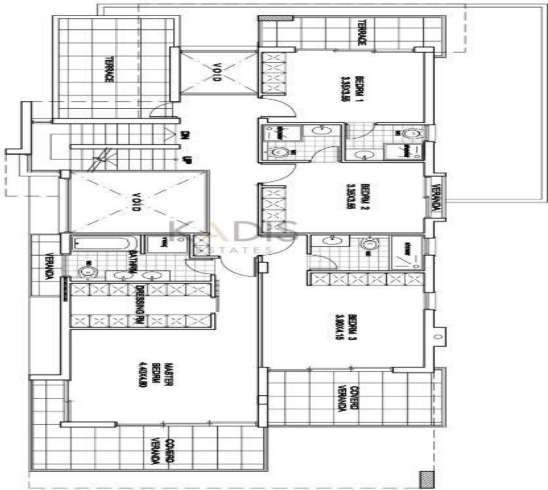
1st FLOOR PLAN SCALE: 1:100