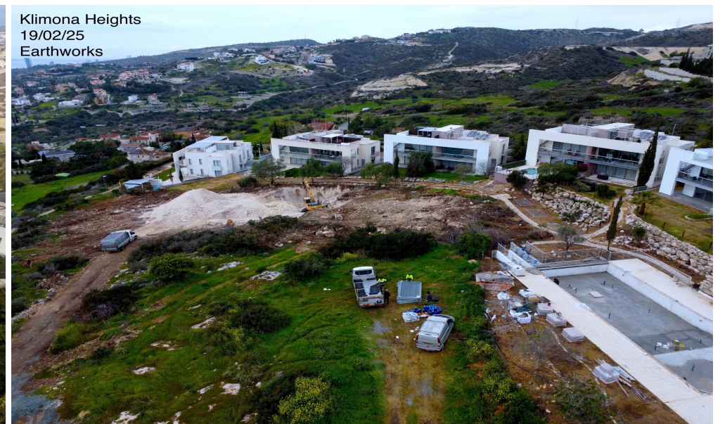
Klimona Heights 19/02/25 Earthworks