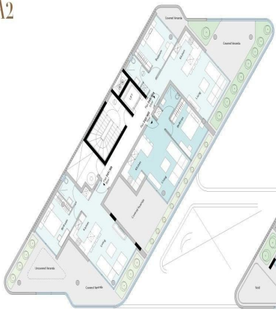
SECOND / THIRD FLOOR