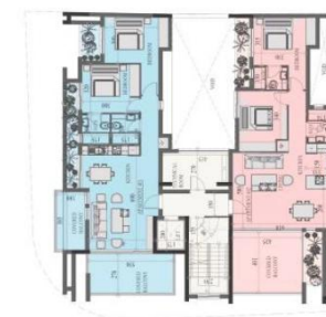
Typical floor two-bedroom apartment covered area 84/85 m 2 covered balcony 17/24m 2 1 storage 1 parking