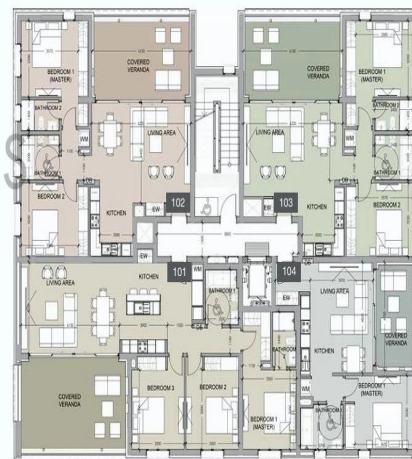
floor 1 block c