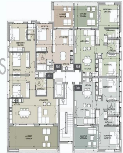
floor 3 block b