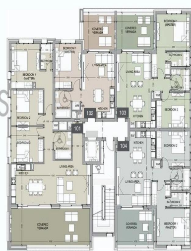
floor 1 block b