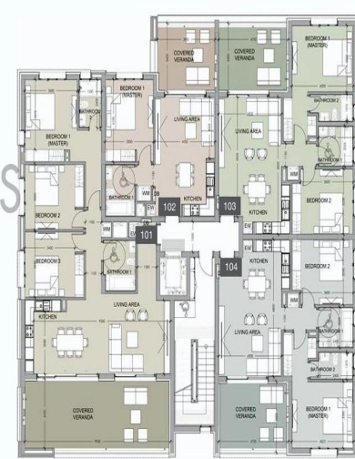
floor 1 block b