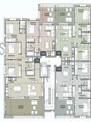
floor 1 block b