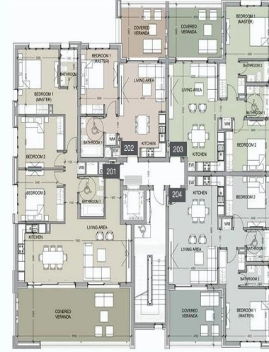
floor 2 block b