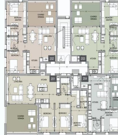
floor 2 block c