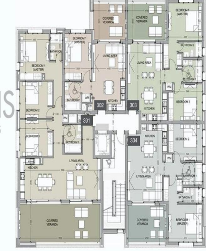
floor 3 block b