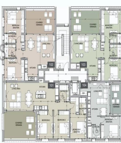
floor 1 block c