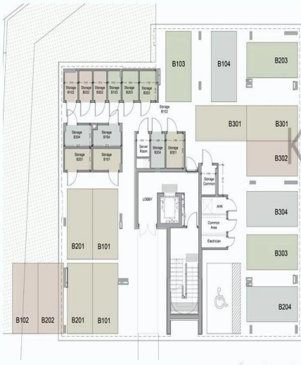
ground floor block b