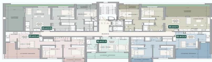
BLOCK B 4TH FLOOR PLAN 1:100