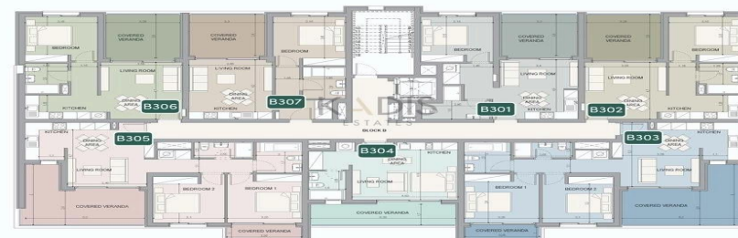
BLOCK B 3RD FLOOR PLAN 1:100