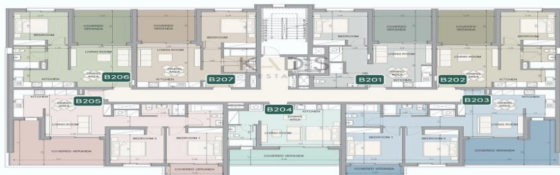
BLOCK B 2ND FLOOR PLAN 1:100