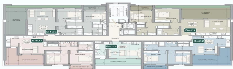
BLOCK B 4TH FLOOR PLAN 1:100