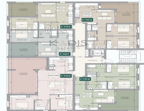
BLOCK C 1st FLOOR PLAN 1:100