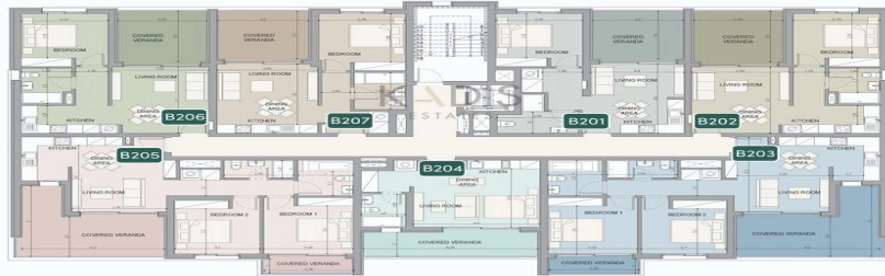
BLOCK B 2nd FLOOR PLAN 1:100