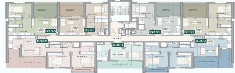
BLOCK B 3rd FLOOR PLAN 1:100