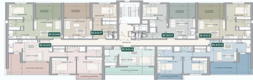
BLOCK B 3rd FLOOR PLAN 1:100