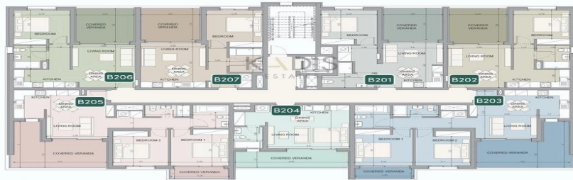
BLOCK B 2nd FLOOR PLAN 1:100