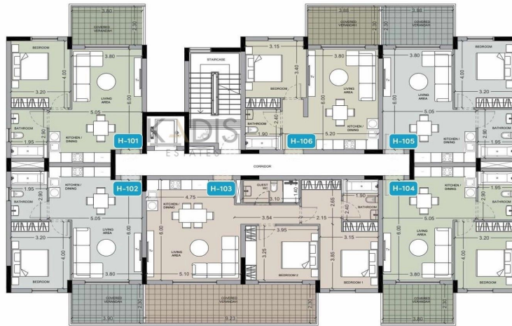
block H 2nd floor