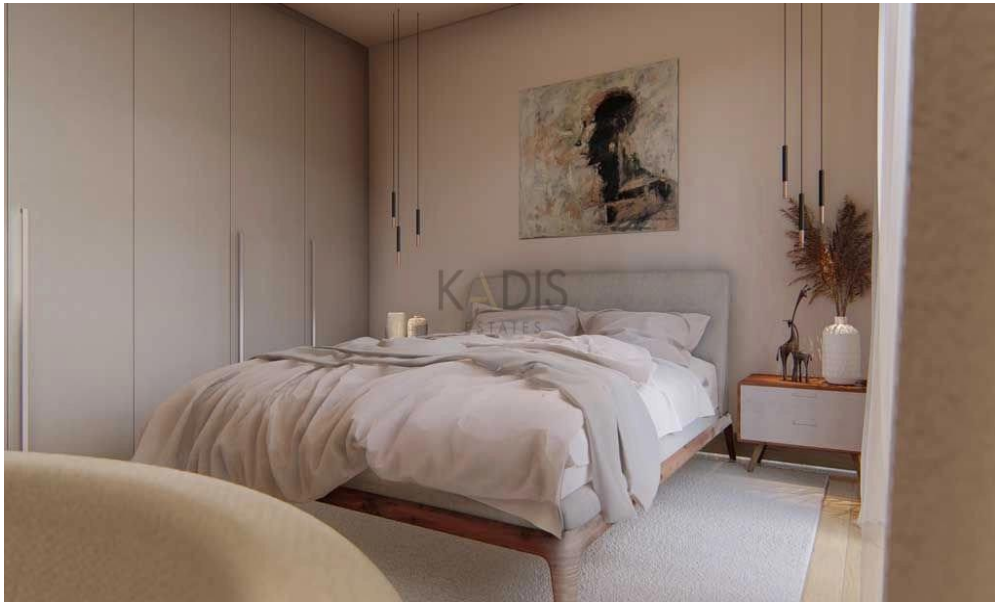
house type a