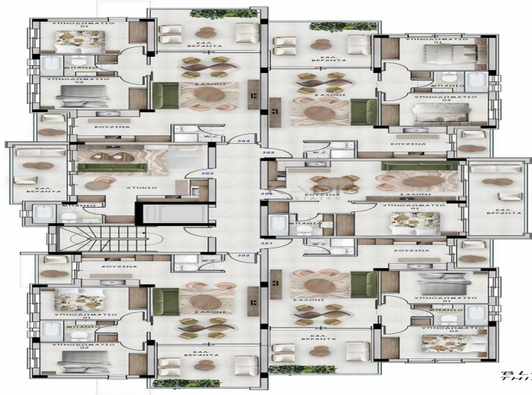
BLOCK B THIRD FLOOR