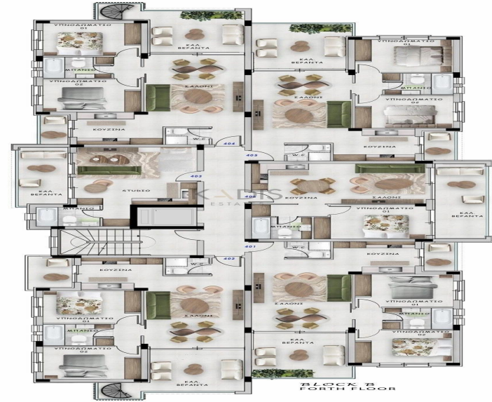
BLOCK B FOURTH FLOOR