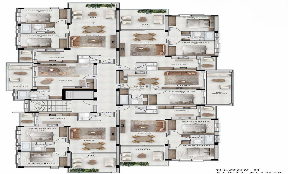
BLOCK B FIRST FLOOR