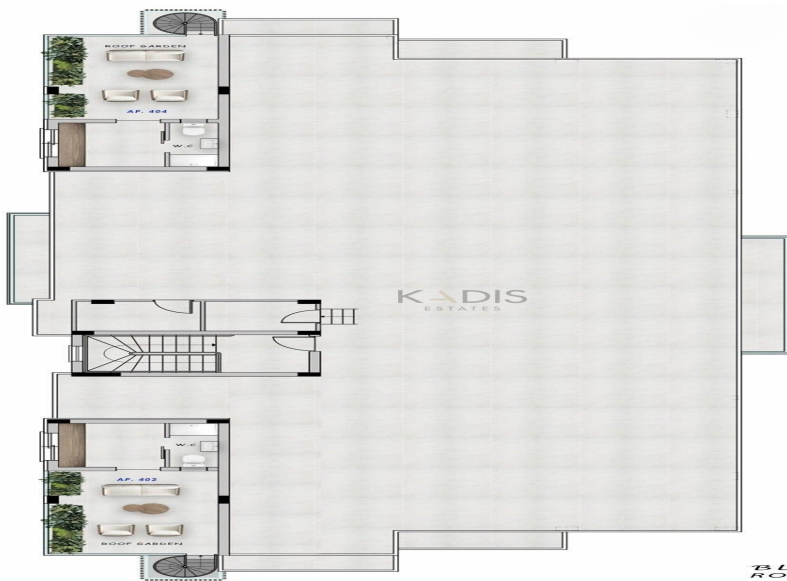
BLOCK B ROOF GARDEN