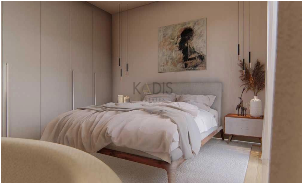
house type a