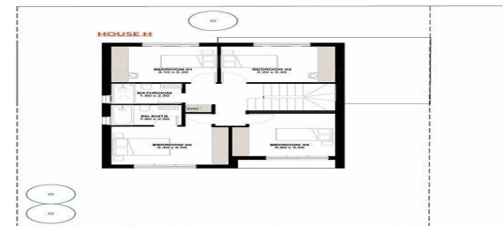
FLOOR PLAN NOT TO SCALE