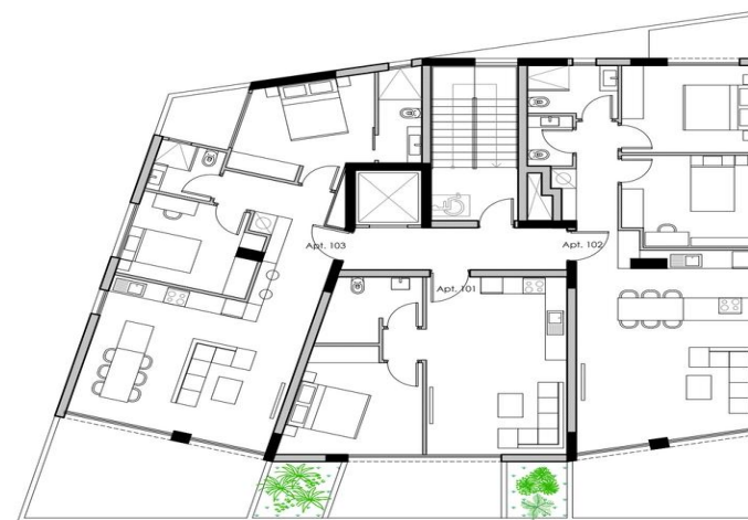
ΚΑΤΟΨΗ 1ου ΟΡΟΦΟΥ