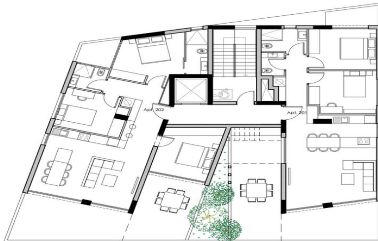
ΚΑΤΟΨΗ 2ου ΟΡΟΦΟΥ