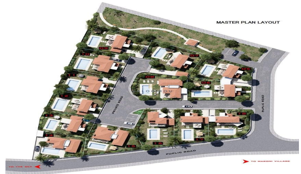
MASTER PLAN LAYOUT