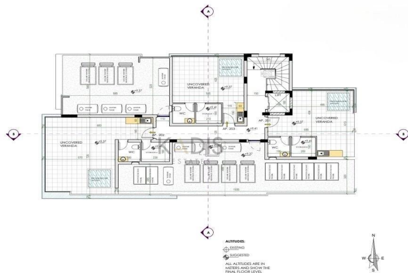
ROOF GARDEN PLAN 1:200