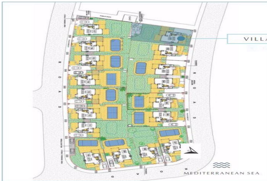
PRELIMINARY GROUND FLOOR PLAN