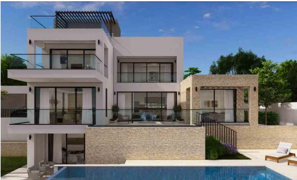
VILLA ARIANA IN PLOT 82 (179)