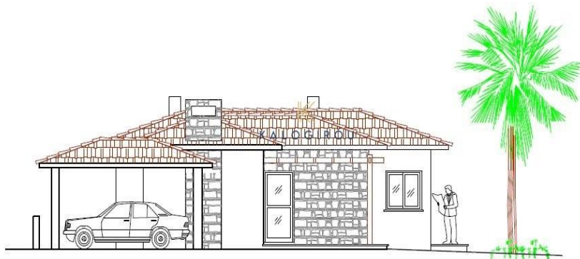
SIDE ELEVATION (EAST)