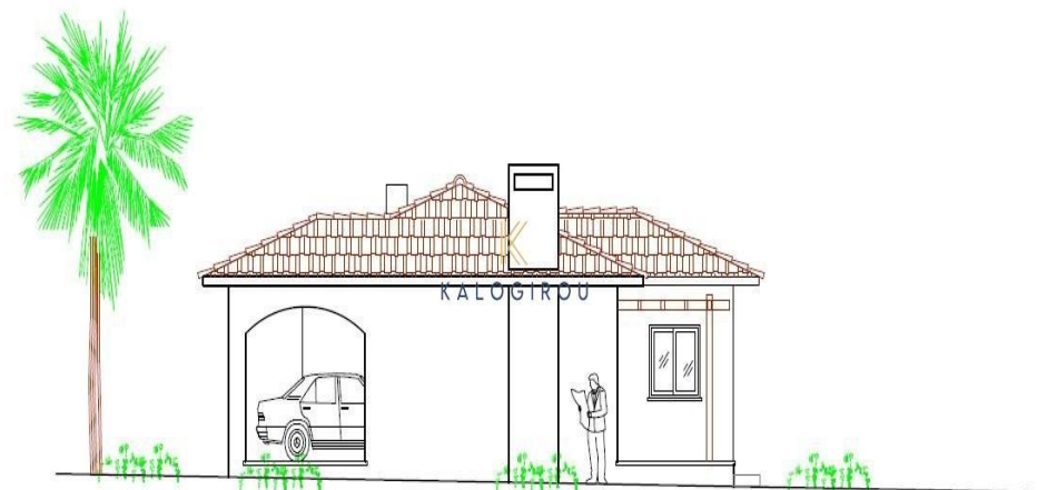
SIDE ELEVATION (EAST)