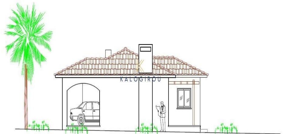
SIDE ELEVATION (EAST)