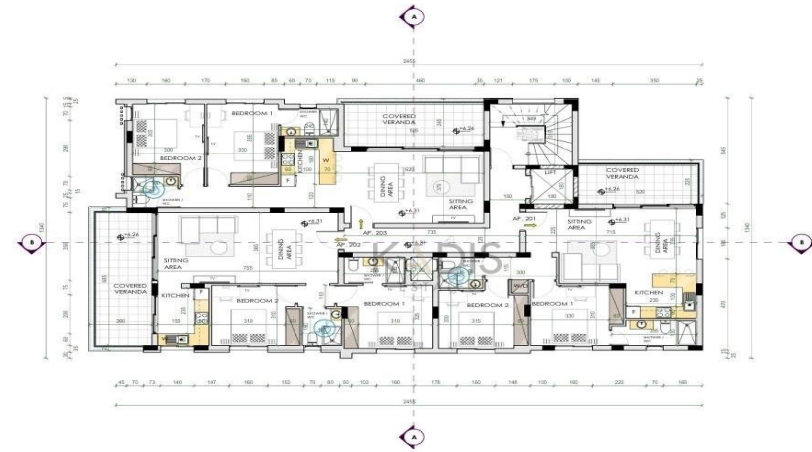
SECOND FLOOR PLAN 1:200