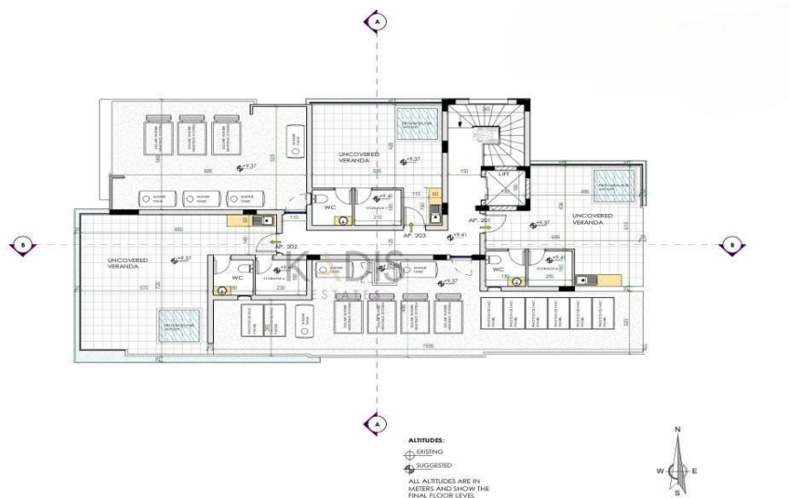
ROOF GARDEN PLAN 1:200