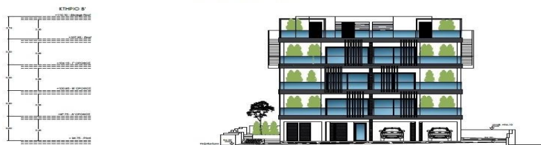
ΤΟΜΗ - ΟΨΗ Κ/Β' ΚΛΙΜΑΚΑ 1/200