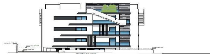
ΒΟΡΕΙΟΔΥΤΙΚΗ ΟΨΗ ΚΤΗΡΙΟΥ Β' ΚΛΙΜΑΚΑ 1/200