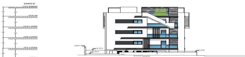
ΒΟΡΕΙΟΔΥΤΙΚΗ ΟΨΗ ΚΤΗΡΙΟΥ Β' ΚΛΙΜΑΚΑ 1/200