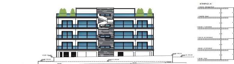
ΝΟΤΙΟΑΝΑΤΟΛΙΚΗ ΟΨΗ ΚΤΗΡΙΟΥ Α' ΚΛΙΜΑΚΑ 1/200