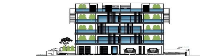
ΤΟΜΗ - ΟΨΗ Κ/Β' ΚΛΙΜΑΚΑ 1/200