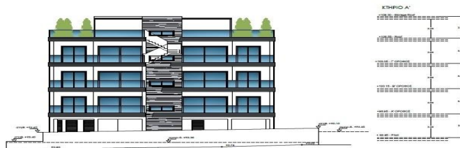
ΝΟΤΙΟΑΝΑΤΟΛΙΚΗ ΟΨΗ ΚΤΗΡΙΟΥ Α' ΚΛΙΜΑΚΑ 1/200