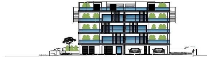
ΤΟΜΗ - ΟΨΗ Κ/Β' ΚΛΙΜΑΚΑ 1/200