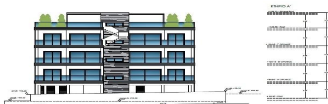
ΝΟΤΙΟΑΝΑΤΟΛΙΚΗ ΟΨΗ ΚΤΗΡΙΟΥ Α' ΚΛΙΜΑΚΑ 1/200