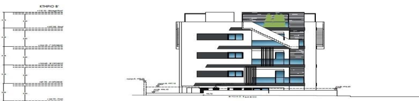
ΒΟΡΕΙΟΔΥΤΙΚΗ ΟΨΗ ΚΤΗΡΙΟΥ Β' ΚΛΙΜΑΚΑ 1/200