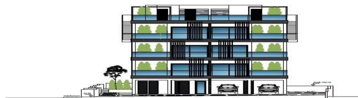
ΤΟΜΗ - ΟΨΗ Κ/Β' ΚΛΙΜΑΚΑ 1/200