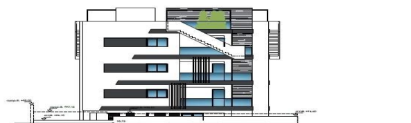
ΒΟΡΕΙΟΔΥΤΙΚΗ ΟΨΗ ΚΤΗΡΙΟΥ Β' ΚΛΙΜΑΚΑ 1/200