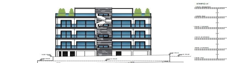
ΝΟΤΙΟΑΝΑΤΟΛΙΚΗ ΟΨΗ ΚΤΗΡΙΟΥ Α' ΚΛΙΜΑΚΑ 1/200