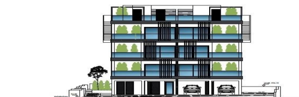
ΤΟΜΗ - ΟΨΗ Κ/Β' ΚΛΙΜΑΚΑ 1/200