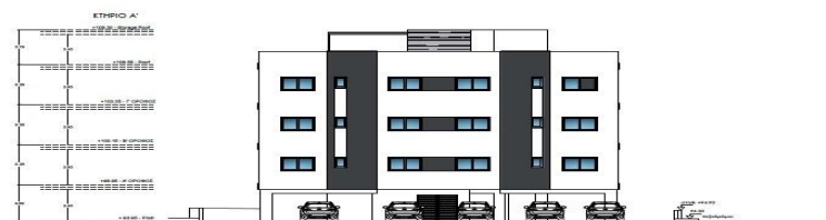
ΤΟΜΗ - ΟΨΗ Κ/Α' ΚΛΙΜΑΚΑ 1/200