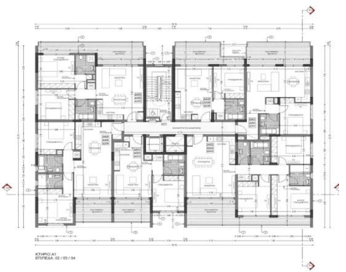
ΣΤΥΠΟ Α1 ΕΠΙΠΕΔΟ 02/03/04