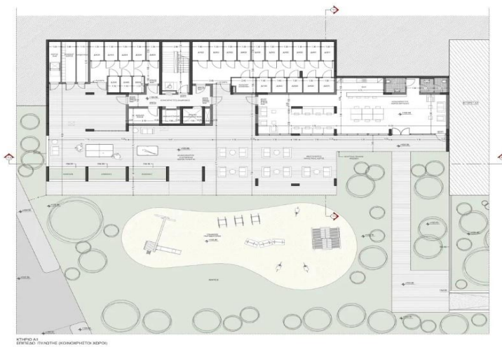
ΣΤΥΠΟ Α1 ΕΠΙΠΕΔΟ ΤΡΥΦΗΤΗΣ (ΚΟΝΙΟΜΗΤΕΚ ΧΕΡΟΣ)