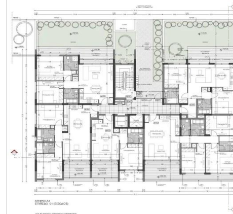
ΣΤΥΠΟ Α1 ΕΠΙΠΕΔΟ 01/ΜΕΘΩΚΟΣ