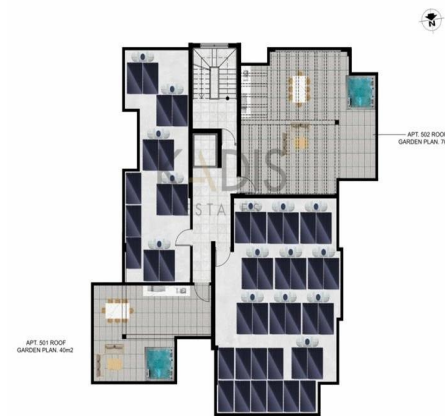
ROOF PLAN / ROOF GARDEN