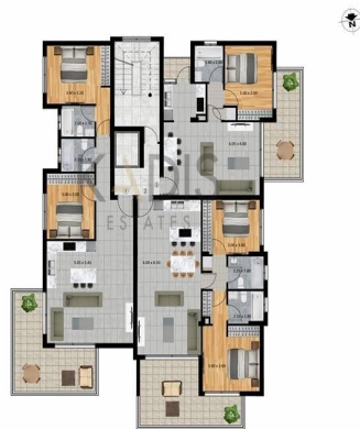
1ST, 2ND, 3RD, 4TH + 5TH FLOOR PLAN