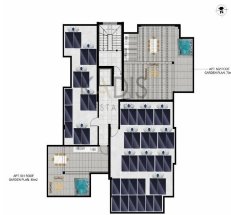
ROOF PLAN / ROOF GARDEN