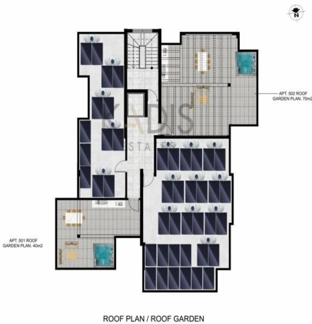
ROOF PLAN / ROOF GARDEN