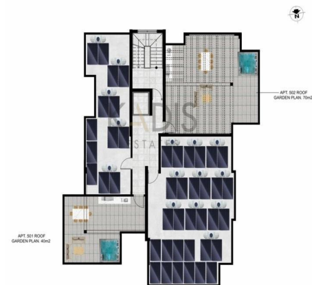
ROOF PLAN / ROOF GARDEN