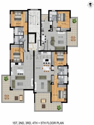
1ST, 2ND, 3RD, 4TH + 5TH FLOOR PLAN