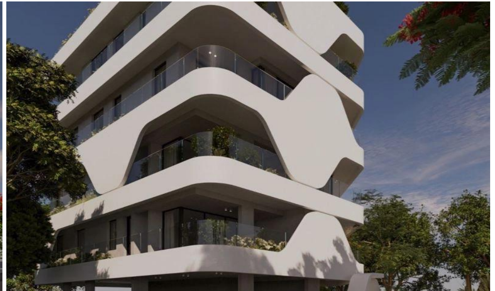
first & second floor consists of one - 2 bedroom apartment plus two - 1 bedroom apartments all with open plan kitchen & living areas, covered verandas with planting areas.