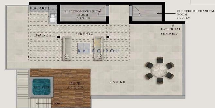
ROOFTOP PLAN FLAT 41