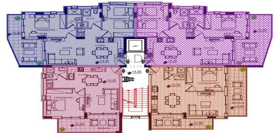
ΚΑΤΟΨΗ 1ου ΟΡΟΦΟΥ - ΔΙΑΧΩΡΙΣΜΟΣ ΚΛΙΜΑΚΑ 1:100